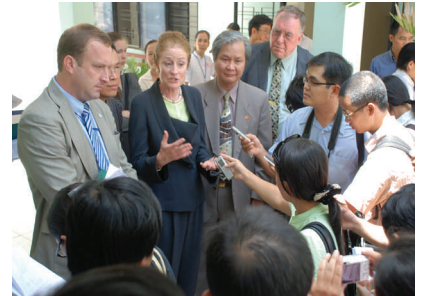
Mdm. Fore at Binh Thanh Methadone Maintenance Therapy Clinic

Answering a question from a journalist whether the U.S. Government would fund the expansion of the MMT program to other regions of Viet Nam, Mdm. Fore stressed that, "this program is owned by the Vietnamese